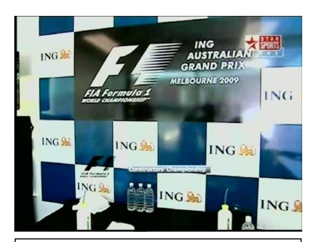
Less impact by the brand due to a number of other brands on screen and small size of brand exposure

For example, in the pictures below, the Melbourne branding in the picture on the right is considered to have more impact on the viewer than that on the left, as' Melbourne' appears larger on-screen and is the only brand on screen.