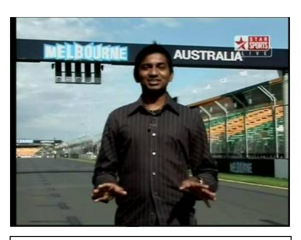
More impact on the viewer due to only one brand on screen and larger size of brand exposure